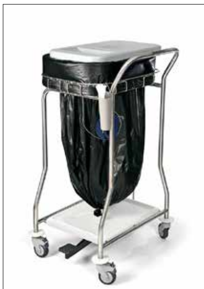
Stand Midi Nouvo Pedal