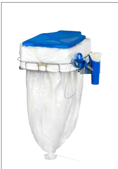
Mini Flex with lid

Wall-mounted solutions are ideal for areas with limited space and where hygiene is important. They also facilitate cleaning.