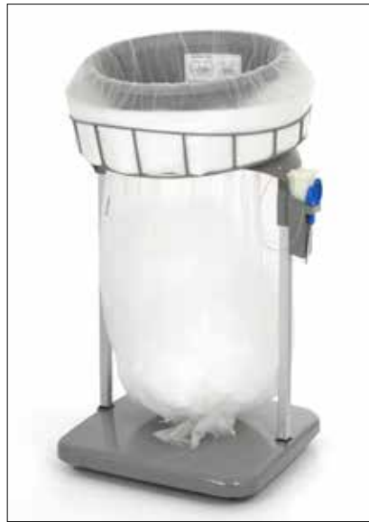
Stand Classic Maxi/Maxi Food