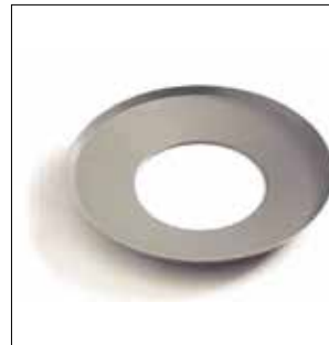
Adapter disc for Longopac Stand Classic Maxi Item no. 30170 Reduces the aperture for easier compression of e.g. recycled plastic. Only available for Maxi.